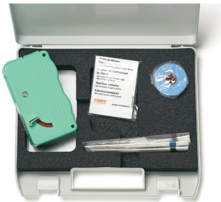
OCK-10 Optical Connector Cleaning Kit (accessory)