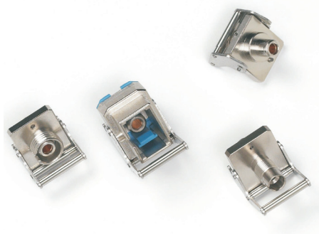
Optical adapters (BN 2150) for laser source output